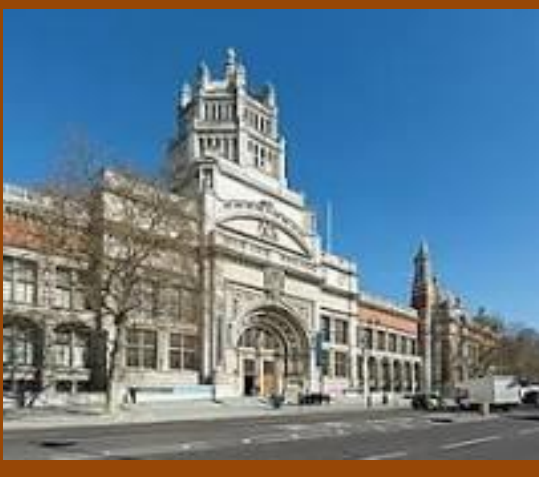
The Victoria & Albert Museum

Out & About Visits was formed recently and so far we have had great success with minibus travel to Church Gardens in Harefield and the British Schools Museum in Hitchin. We are looking forward to more of these trips in 2025, so check our notifications in 2025 for details.