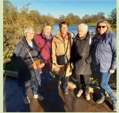
Our walk in Verulamium Park, St Albans

We shall walk for about an hour and then go to the pub for refreshments.