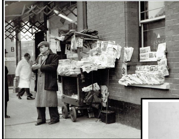
The photo is an exact moment in the news vendor's day and is labelled "Tuesday 16th March 1954, 11.45am". It was taken outside the Rose and Crown Hotel which was on the corner of Market Street.

On 5 December 1916, an explosion at Barnbow Shell Factory in Leeds killed 35 female workers and injured many more. Today, the site of the factory is protected as a scheduled monument by the Department for Culture, Media and Sport. but at the time the accident was hushed up.