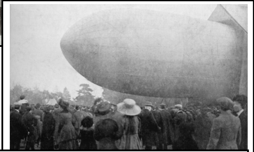
5th March 1911. They came from miles around to see Mr Willow's balloon, "The City of Cardiff", the first airship seen in Watford, as it prepared for take-off after emerging from its hangar in Bushey Hall Road, Bushey.

It was only a sunny smile, and little it cost in the giving, but like morning light it scattered the night and made the day worth living. F Scott Fitzgerald