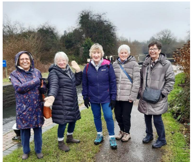
Damp Canal walk, January 2025

New walkers are very welcome to join our friendly group.