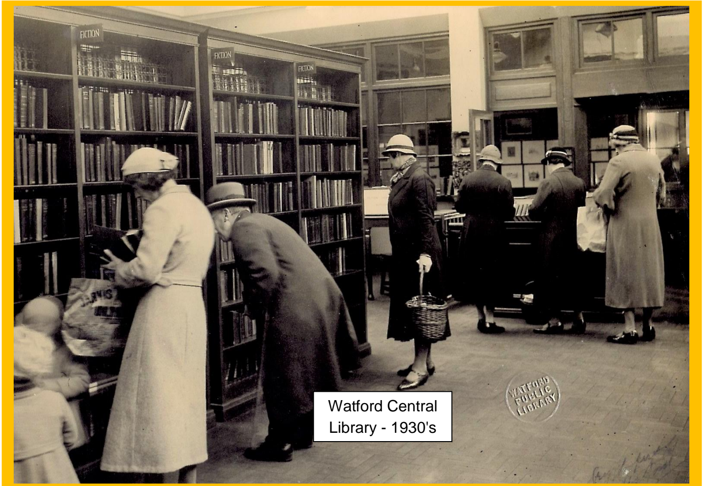
Watford Central Library - 1930's

Watford Peace Memorial Hospital when first built, prior to the installation of the Spirit of War statues, cast in bronze from the Mary Bromet sculptures. These were removed and placed at the side of the town hall in the 1970's when Rickmansworth Road was widened.