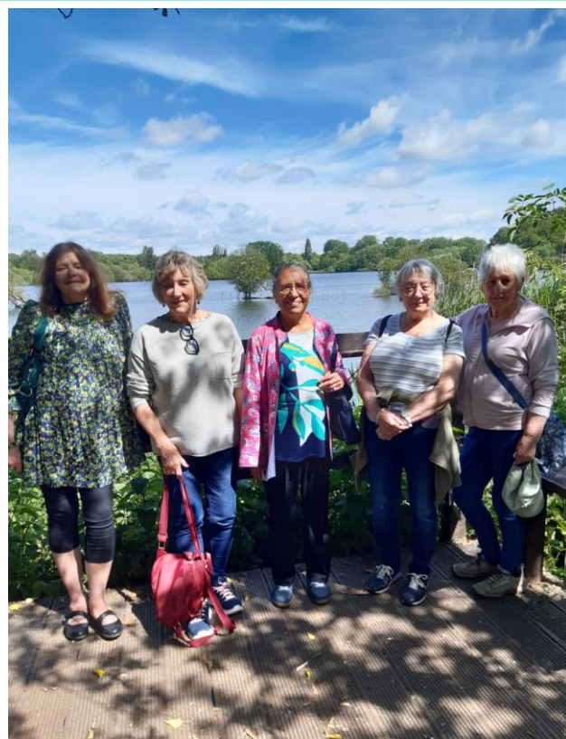
Our walk around Stockers Lake in Rickmansworth