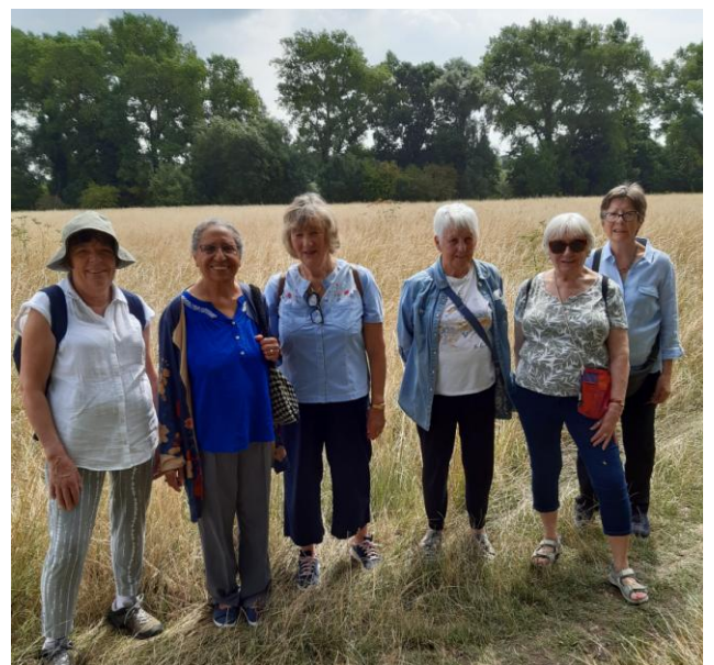
Here we are in a field on the way to Hampermill Oxhey on our last walk.