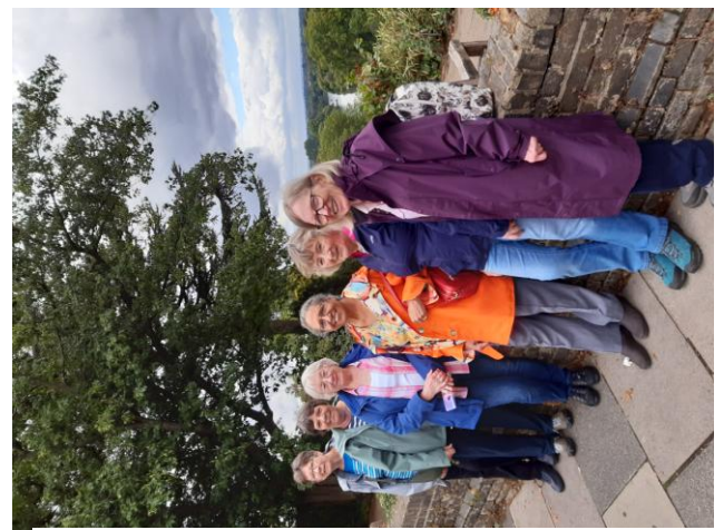
This photo was taken on the last walk to the top of Richmond Hill.