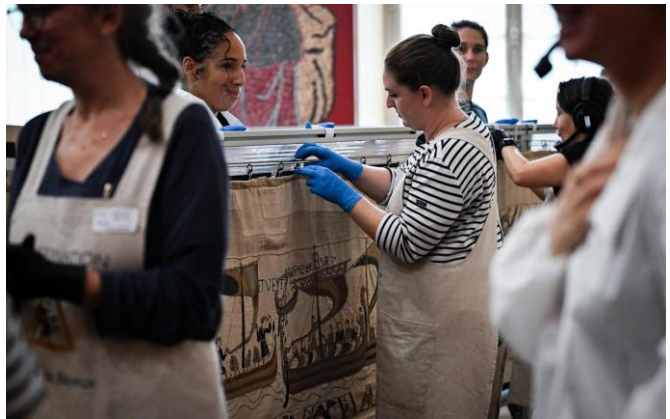
Conservators preparing the Bayeux Tapestry for transportation to the UK.

This historic loan, marking its first UK visit in nearly 1,000 years, will be in the Sainsbury Exhibition Gallery while the Bayeux Museum in Normandy undergoes renovations.