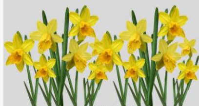
FB/EnglishLiterature1 English Literature