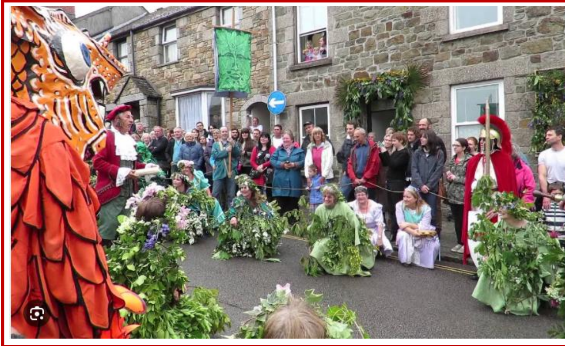
The Helston Floral Day or Dance

May Day 8th May 2026 Who remembers May Day celebrations & May Pole Dancing at school?