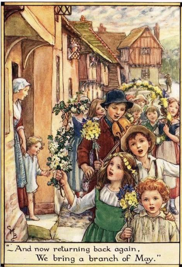
~ And now returning back again, We bring a branch of May."

May Day 8th May 2026 Who remembers May Day celebrations & May Pole Dancing at school?