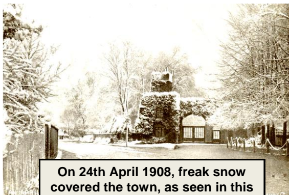
On 24th April 1908, freak snow covered the town, as seen in this WO photo of the Park Gates