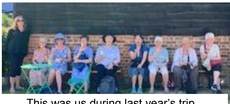
This was us during last year's trip eating the much needed ice cream at the Open Air Museum.